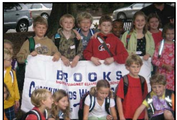
Students arrive at Brooks on "Walk to School" day.